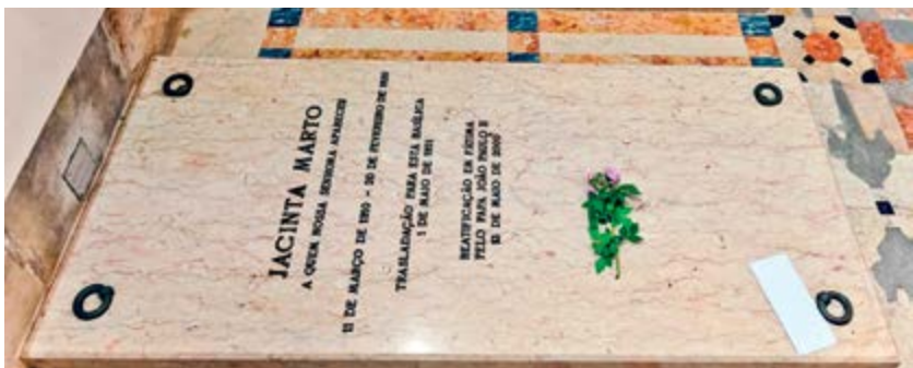
The tomb of blessed Jacinta in the Basilica of Our Lady in Fatima

Let us conclude that Jacinta's many little prayers were so pleasing to Our Lady that not only did Our Lady fulfill the wishes of her little seer, but she transformed Jacinta into a great saint. Certainly Jacinta prayed much more for others than for herself in her short life. Our Lady's reward should always remind us of the old rule: what you do for others, you do twice for yourself!